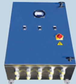
ELECTRONIC CONTROL DEVICE ECU-1000